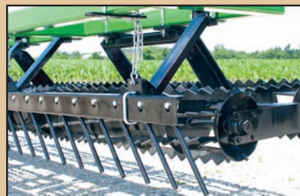
Diagonal or Straight Round Bar