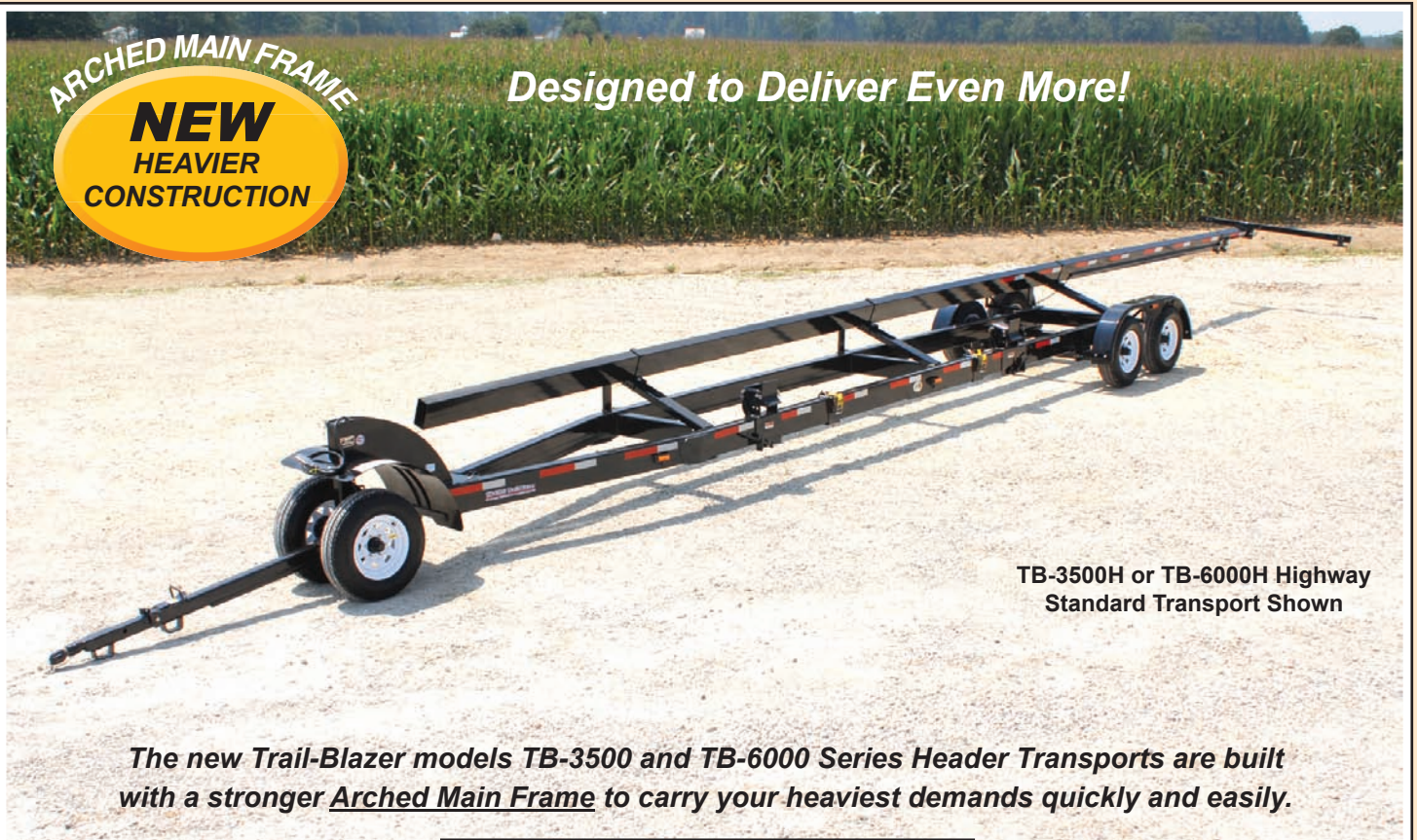
TB-3500H or TB-6000H Highway Standard Transport Shown

The new Trail-Blazer models TB-3500 and TB-6000 Series Header Transports are built with a stronger Arched Main Frame to carry your heaviest demands quickly and easily.