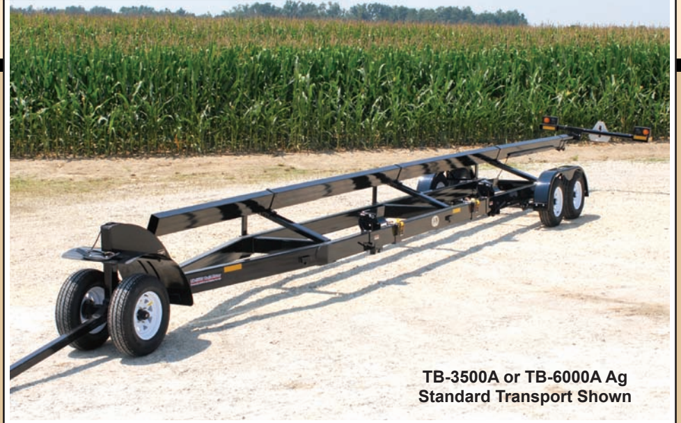
TB-3500A or TB-6000A Ag Standard Transport Shown